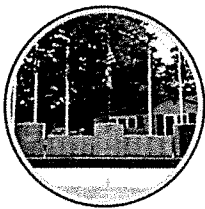
Veterans Memorial Park

$569,786.93 towards more than 500 individual grants to 77 different Athens organizations and programs.