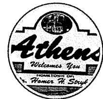
South Entrance of Village