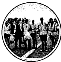
Adopt a Highway cleanup