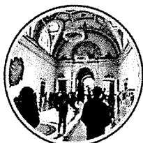
Detroit Institute of Arts