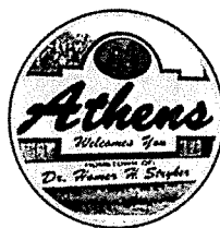
North Entrance to Village