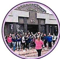
Prom dress giveaway