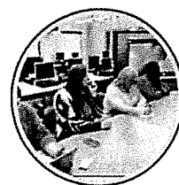
Student loan and debt discussion