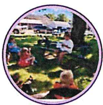
Summer reading program