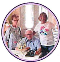
Senior time @ Greenfield House